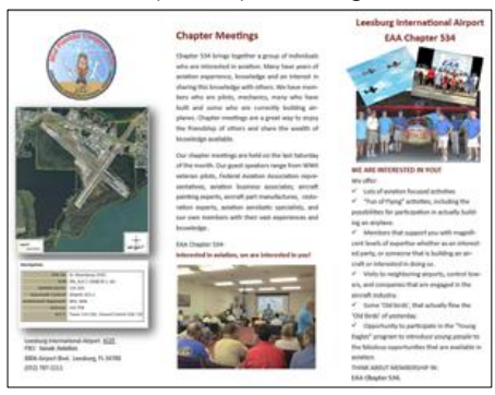
Front side, tri-fold

After our last meeting we were contacted by Tracey Dean re: NBAA convention in Las Vegas and would we like to put some brochures out for our Chapter there? We would, but our brochure was neither current nor complete. So Laura, Joel, Jodie and a number of others buckled down and in about three days came up with a very nice updated brochure. Looking at printing costs was daunting until Steve Barber found a printer at a VERY reasonable price that could turn these three fold brochures out quickly on nice stock. Including shipping the whole thing took about one week and we now have 2000 brochures, a good batch of which will be appearing in the Florida Economic Development Council / City of Leesburg stand at the National Business Aircraft Association (NBAA) Las Vegas convention.