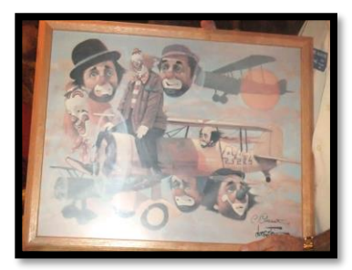
It's coming back!